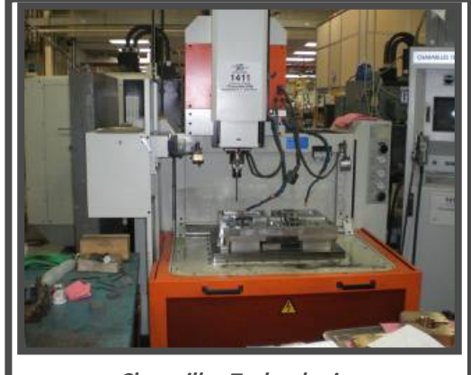
Charmilles Technologies Roboform 41 Ram EDM

Read the SDS specific to the products in use at your facility for detailed information on the health effects of exposure to beryllium.